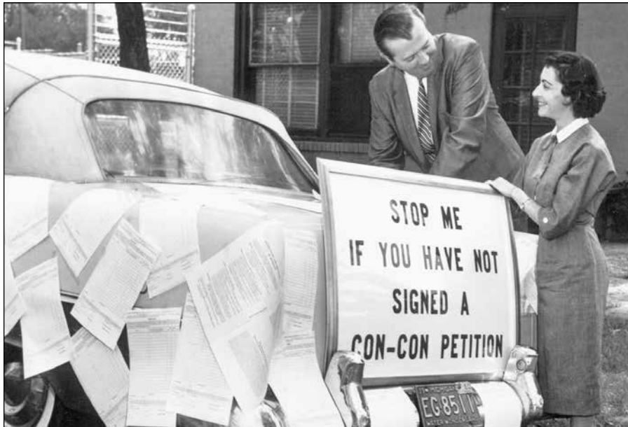
League of Women Voters, 1960.