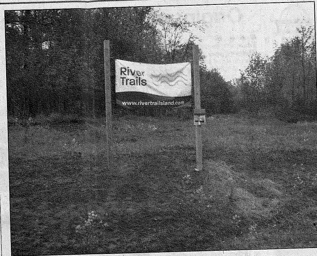
The River Trails project will pursue seven larger lots in a revised first phase after the Department of Environment, Great Lakes and Energy said it would not grant a variance request for elevated levels of uranium found in the groundwater.

In addition to this work, the city has reapplied to EGLE for a $14 million water project and $16 million sewer project. Substantial principal forgiveness would be needed to move