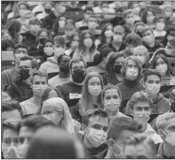
Students wear mouth-to-nose coverings while sitting close to each other during the lecture 'BWL 1' in lecture hall H1 of the Westfälische Wilhelms-Universität in Münster, Germany, on Oct. 21. Germany's disease control agency has reported the highest number of new infections with the coronavirus since the outbreak of the pandemic.