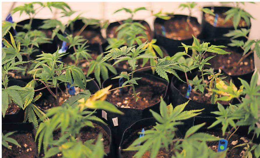
Marijuana plants grow inside of The Woods cultivation and processing center in Kalamazoo in January. The facility opened their facility in 2020.