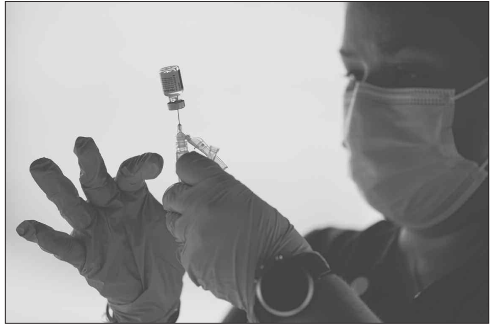
In this Sept. 14 photo, a syringe is prepared with the Pfizer COVID-19 vaccine at a clinic at the Reading Area Community College in Reading, Pa. Millions of U.S. workers now have a Jan. 4 deadline to get a COVID vaccine. The federal government on Thursday announced new vaccine requirements for workers at companies with more than 100 employees as well as workers at health care facilities that treat Medicare and Medicaid patients.

Government relief checks and the rollout of vaccines have given consumers the confidence and financial wherewithal to resume spending — so much so that companies have scrambled to keep up with surging demand. They complain they can't find workers to fill their job openings — a near record 10.4 million in August — and are being forced to raise wages, offer signing bonuses and improve benefits and working conditions.