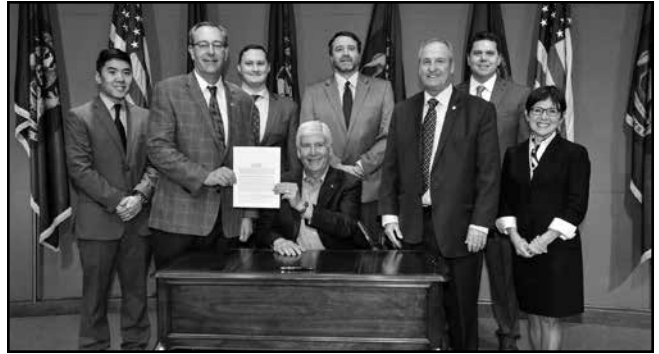
Legislators with the Governor at a bill signing ceremony.

Restricted revenues are those resources which, by Constitution, statute, contract, or agreement, are reserved to specific purposes. Expenditures of restricted revenues are limited by the amount of revenue realized and amount appropriated. In addition to the General Fund, special revenue funds are used to finance particular activities from the receipts of specific taxes or other revenue. Such funds are created by Constitution or a statute to provide certain activities with definite and continuing revenues. Other types of