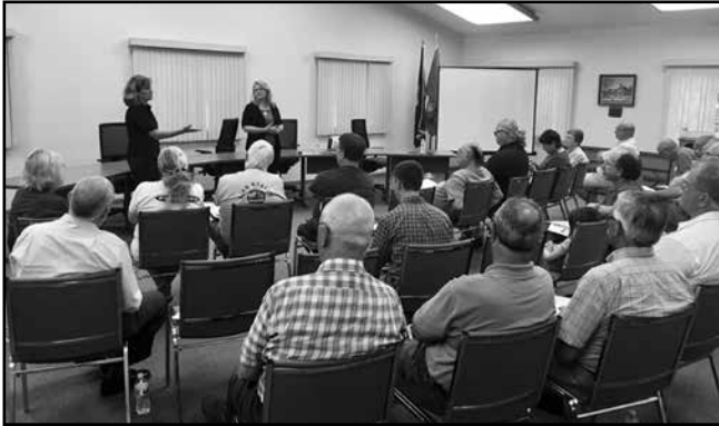
Legislators meet with constituents at a Town Hall meeting to discuss current issues.

The principal responsibility of a state legislator is the business of lawmaking. The business of lawmaking is a demanding one, in that legislators must perform a wide array of duties which require a diversity of skills and abilities. In addition to sponsoring and introducing bills, which require administrative, managerial, and political skills, a legislator must attend sessions and committee meetings and study the many bills introduced by other lawmakers, which requires analytical skills.