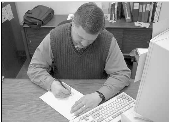
A well-written letter or e-mail is usually the best way to communicate concerns and ideas to a legislator.

i. It is easy , particularly when dealing with legislators who disagree with you, to become angry and frustrated.