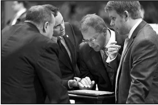
Legislators discussing the state's budget.

recent years, the budget has been completed in early June, giving local governments time to adjust their budgets prior to the start of their fiscal year, July 1. However, in contentious years, the budget might not be completed until later in the summer.