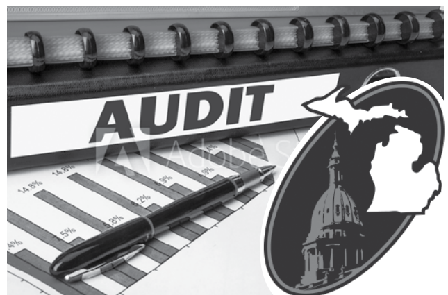
The Office of Auditor General (OAG) examines agency financial records and reviews program operations.

The Legislature also exercises its oversight authority through the appropriations process. In addition to using budget amounts to reflect the Legislature's wishes, appropriations bills often include various reporting mechanisms to monitor how state and federal funds are being spent. The budget document has built into it so-called "boilerplate" provisions that accommodate the oversight of past appropriations. For example, a boilerplate provision may require a department to report to the Legislature or a specific committee.