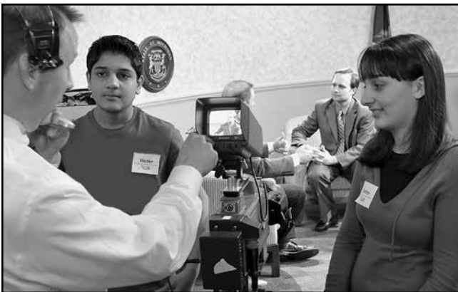
These students from the Republic of Georgia and Pakistan come to learn about Michigan's Legislative process and how a legislator produces his local cable show.

An excellent way of finding out what it is actually like to work in the Legislature is to participate in a student intern program which may be offered by your local school district or a college or university. Other programs, sponsored by various civic organizations, involve young people from across the state in mock legislative sessions and are good ways of gaining firsthand knowledge and experience.