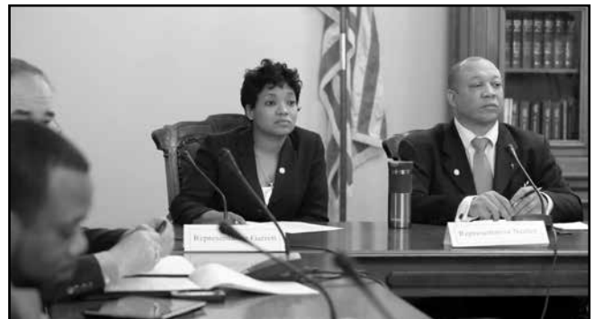
Legislators attend a committee meeting.

The major focus of a standing committee is prospective in nature because the committee is considering bills to correct existing problems and solve future needs. However, there may also be a retrospective focus in that a standing committee may evaluate how well state agencies are carrying out