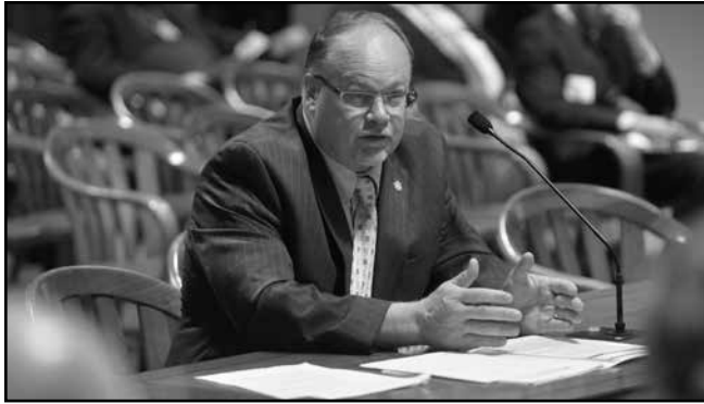
Testimony is vital to the process of gathering information.