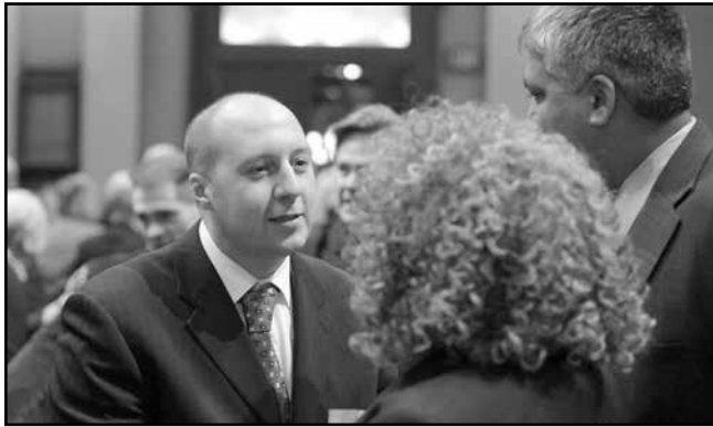
Members of the Senate and House of Representatives join in conversation.

Management, and Budget. The fiscal agencies also prepare detailed reviews and analyses of the Governor's proposals, which are made available to all members of the House and Senate. Subsequently, the subcommittees in each chamber receive more detailed information from department officials regarding the executive budget, hold public hearings, and report their recommendations to the full committees.