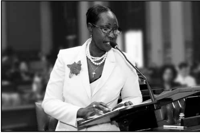
Legislator addresses colleagues on the House Session floor.

The same procedures related to approval of other legislation by the Governor also apply to appropriation bills, except that the Governor has line item veto authority and may disapprove any distinct item or items appropriating money in any appropriation bill. The part or parts approved become law, and the item or items disapproved are void unless the Legislature repasses the bill or disapproved item(s) by a two-thirds vote of the members elected to and serving in each chamber. An appropriation line item vetoed by the Governor and not subsequently overridden by the Legislature shall not be funded unless another appropriation for that line item is approved.