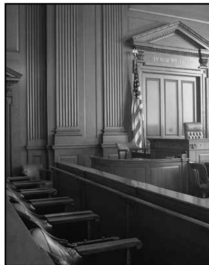
Court decisions as handed down in this county courthouse sometimes bring about the need to make changes in the law.

and conditions play an important role in the transformation of ideas into bills. Even though the goals, interests, and priorities of the people are in constant change, these early stages of the legislative process continue to determine how an idea becomes a bill.