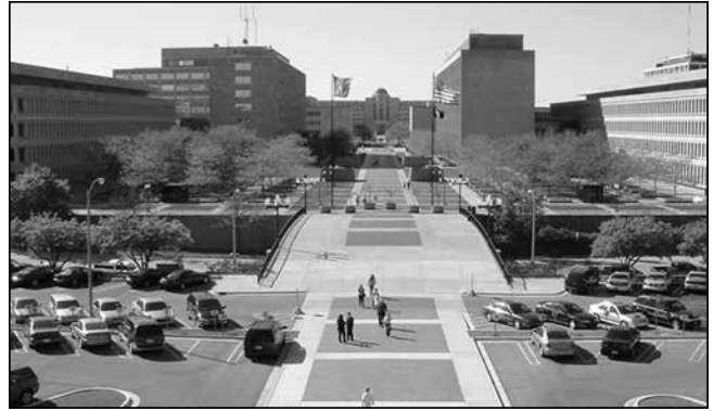
As administrators of the state's laws, the departments of the executive branch provide important input to the work of the Legislature.

The activities of the federal government can also influence legislation on the state level. Both the U.S. Congress and the federal executive departments have established a host of programs that require the states to develop matching plans.