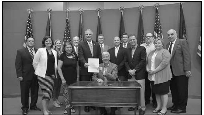
The Governor, Legislators and supporting citizens at a bipartisan bill signing ceremony.

c. Choose not to sign or veto the bill. If the bill is neither signed nor vetoed, the bill becomes law 14 days after having reached the Governor's desk if the Legislature is in session or in recess. If the Legislature should adjourn sine die before the end of the 14 days, the unsigned bill does not become law. If the Legislature has adjourned by the time the bill reaches the Governor, he or she has 14 days to consider the bill. If the Governor fails to approve the bill, it does not become law.