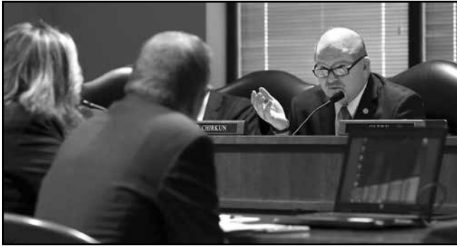
Legislator interacting with members of the public during a committee hearing.

When a bill is scheduled on the committee agenda for consideration, and if you have an active interest in the legislation and feel there are contributions you can make to the committee process, you may decide to testify at either a meeting or a hearing. The purpose of testimony given should be to inform so that committee members can vote on the bill with as full an understanding as possible of all sides of the issue it addresses and the consequences of its passage. In a meeting, the sponsor, experts on the problem, and informed members of the public will normally be heard. If the measure is controversial or additional information is needed before a decision can be reached by the members, most committees will gladly put the bill over to a future meeting or even a public hearing.