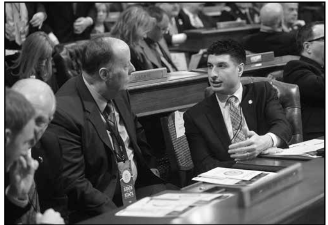
Each legislator brings unique ideas, experience, and understanding to the legislative process.