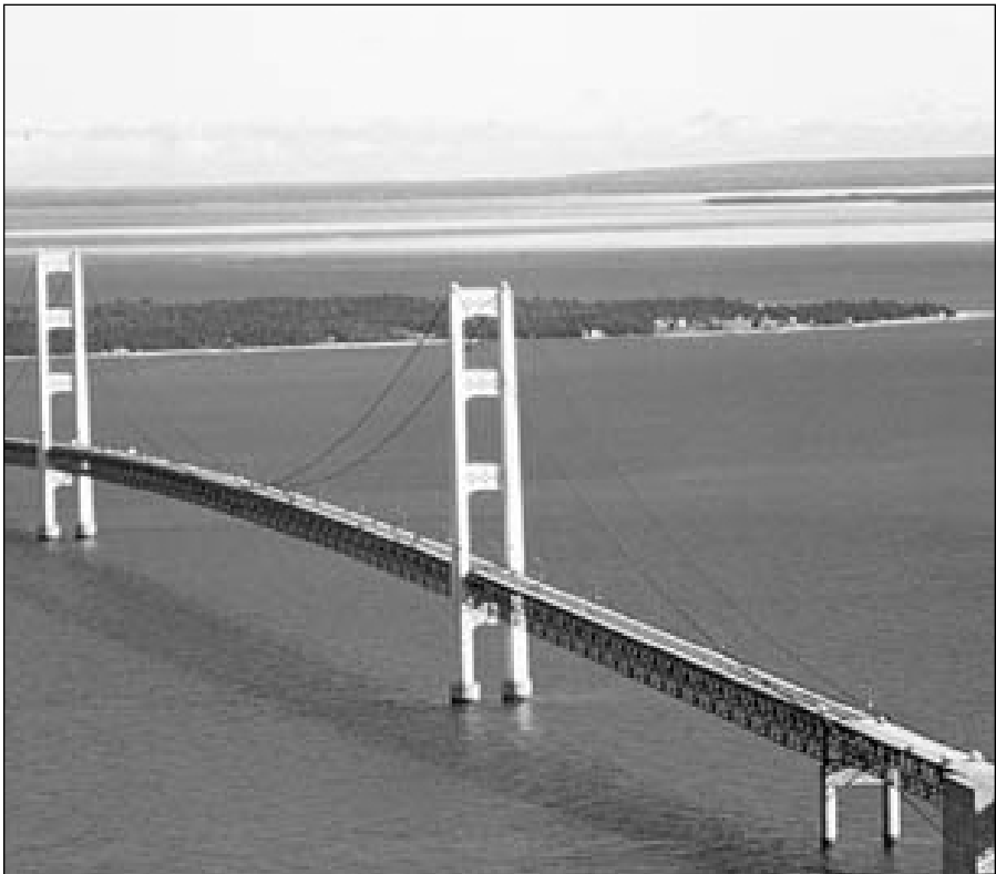
When the Mackinac Bridge opened in 1957, it represented an engineering marvel as well as the fulfillment of the dream of connecting Michigan's two great peninsulas.

The state's active promotion of overall economic development and the tourist industry also contributed to support for a bridge. An Economic Development Department was created in 1947 to coordinate efforts to strengthen and diversify the state's economy. The Michigan Tourist Council, established in 1945, promoted the state as a desirable destination for vacationers. Businesses related to the tourist industry prospered and efforts to capitalize on the growth continued. In 1950, the Mackinac Bridge Authority was reconstituted and, after the marketing of bonds to finance the project, work on the bridge began in 1954. The Mackinac Bridge officially opened on November 1, 1957, and Michigan's ultimate "internal improvement" was complete.