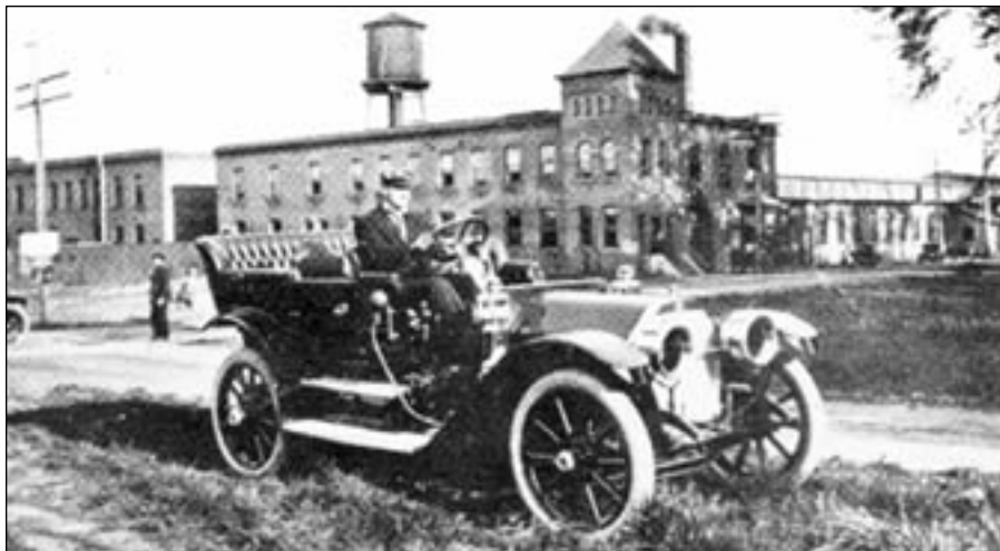
The Olds Motor Works in Lansing.