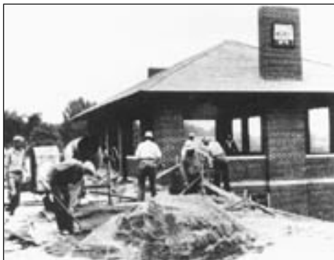
WPA projects employed thousands of displaced autoworkers.

As the "Arsenal of Democracy," Michigan played an unparalleled role in fighting tyranny abroad during World War II . Even before the nation had been drawn into the global conflict, steps had been taken to prepare the vast industrial resources of the state for conversion to war production. The state's enormous industrial capacity, bolstered by mass production techniques, was ideally suited for the industrial and technological needs of modern warfare. The auto industry, which ceased civilian automotive production altogether in February 1942, quickly converted to the production of aircraft, tanks, guns, and other materials. By the end of the war, Michigan had contributed more than 4,000,000 engines, 25,000 tanks, and 8,500 B-24 Liberator bombers to the war effort. In terms of human resources for the armed forces, more than 600,000 Michigan men and women answered their nation's call to arms. As a result, thousands of people from other states, particularly the South, and from rural Michigan flocked to the cities to meet the demand for both skilled and nonskilled labor.