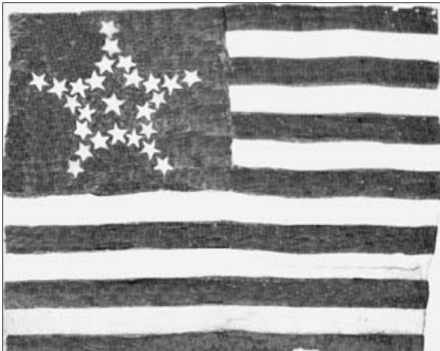
A twenty-six-star flag, reflecting Michigan's admission to the Union.

established. The onset of steam transportation to Michigan and the completion of the Erie Canal in New York in 1825 opened the floodgates as farmers and families from New England and New York joined the westward migration. By the 1830s, the rush to Michigan — “ Michigan Fever ” — was in full gear, and the territory grew faster than any other part of the country. In 1820, according to the census, Michigan had 8,896 people, excluding Indians. By 1830, the population had jumped to nearly 32,000, and in 1840, there were 212,267 inhabitants.