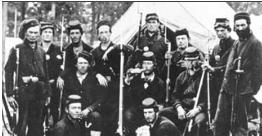
Third Michigan Infantry. Between 1861 and 1865, 90,000 Michigan soldiers served in the Civil War.