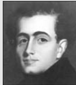
Stevens T. Mason

As Michigan prepared for statehood, Acting Governor Stevens T. Mason , who was appointed to this post at the age of nineteen by President Andrew Jackson, led the effort to assert Michigan's dominion over this area. In April 1835, Governor Mason called for volunteers and mobilized troops to go to the Toledo strip to enforce laws passed by Michigan that imposed a fine or imprisonment on anyone who contested Michigan's authority on this land. Led by Mason, who was nicknamed "the Boy Governor," the Michigan militia arrested several surveyors who were representing Ohio's interests. The actions of Governor Mason incensed President Andrew Jackson, who removed Mason from office on August 29, 1835.