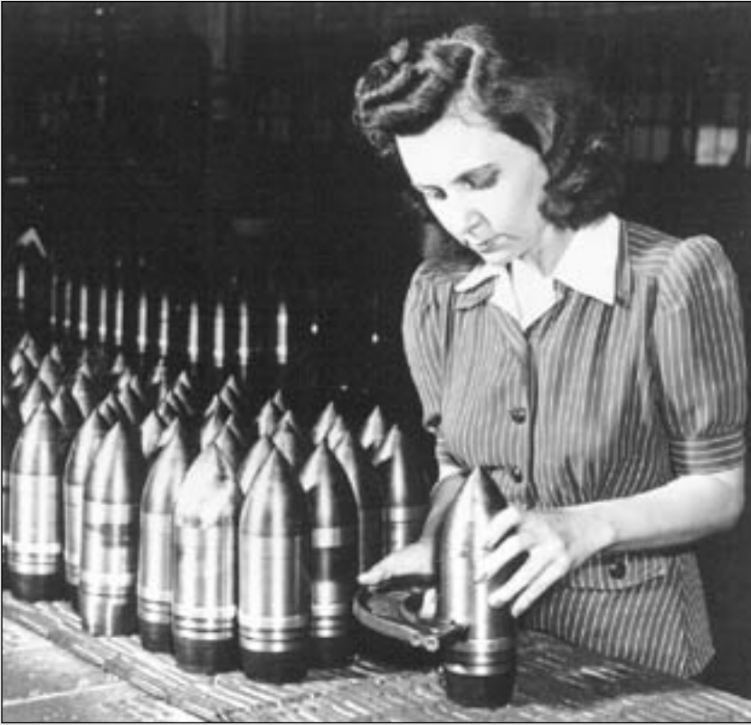
The war effort at home. Many observers trace the origins of the modern women's movement and the growth of women in the work force to their heroic contributions as civilians during World War II.