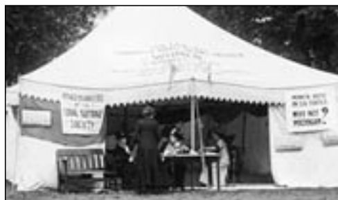
Women's suffrage movement in Michigan.

Women's rights advocates had lobbied for women's suffrage in Michigan for many years. By 1867, taxpaying women were permitted to vote in school elections. The issue of women's suffrage was debated extensively during the Constitutional Convention of 1907-1908, and the Constitution of 1908 granted taxpaying women the right to vote on questions involving the expenditure of