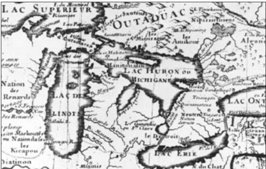
The Delisle Map. This 1703 map is thought to be the first to include Detroit.