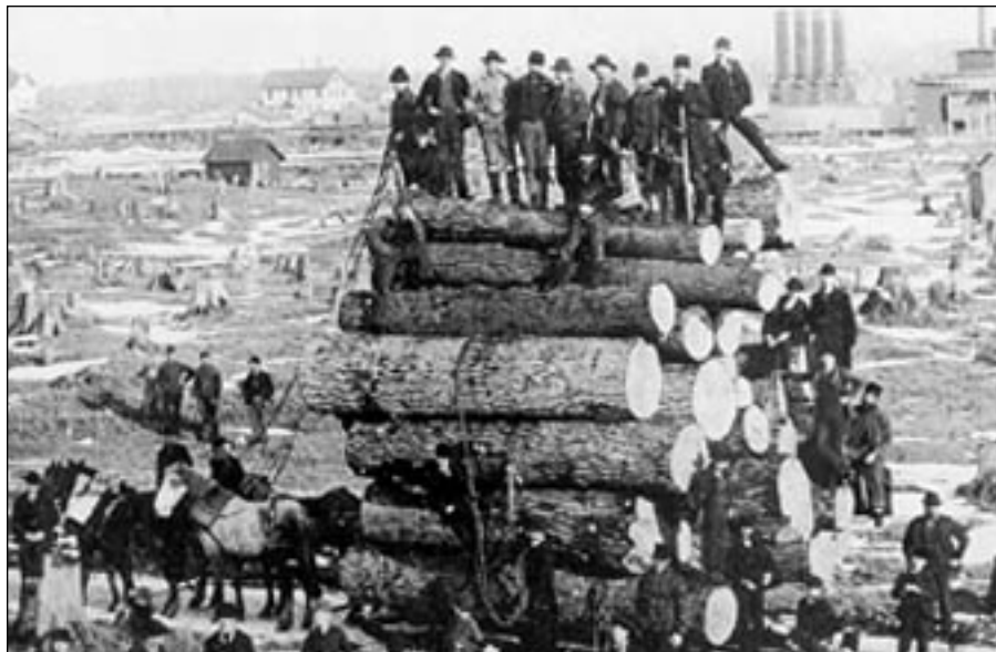
Hermansville, Michigan, in the Upper Peninsula in 1892. This photo shows the aftermath of the clear-cut logging practices of the logging boom.